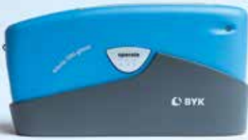
micro-gloss with smart-lab Professional data analysis to increase your efficiency